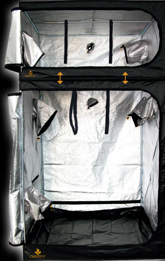
120 cm 120 cm 195 cm DR120T