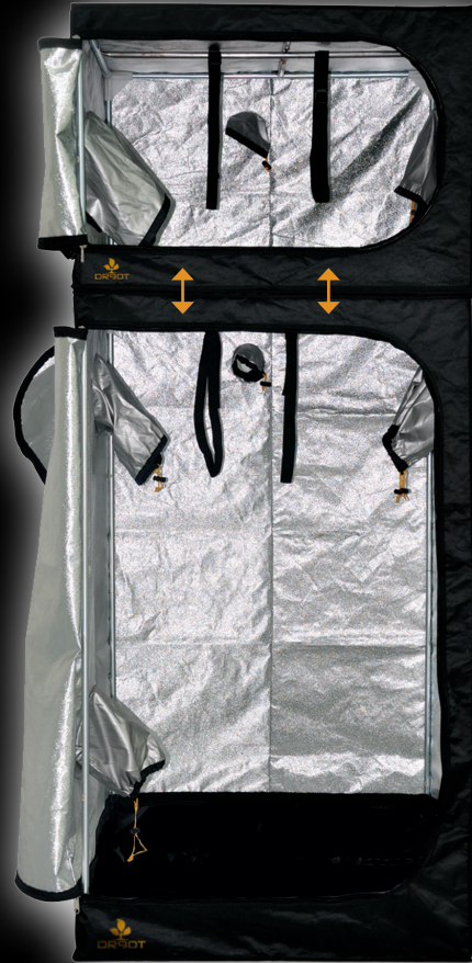
90 cm 90 cm 195 cm DR90T