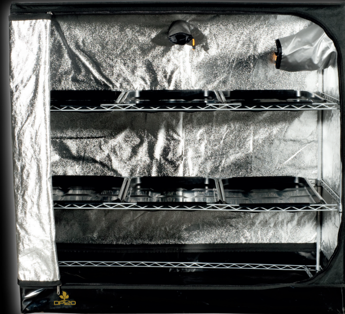
125 cm 60 cm 120 cm DP 120 AVAILABLE 2011