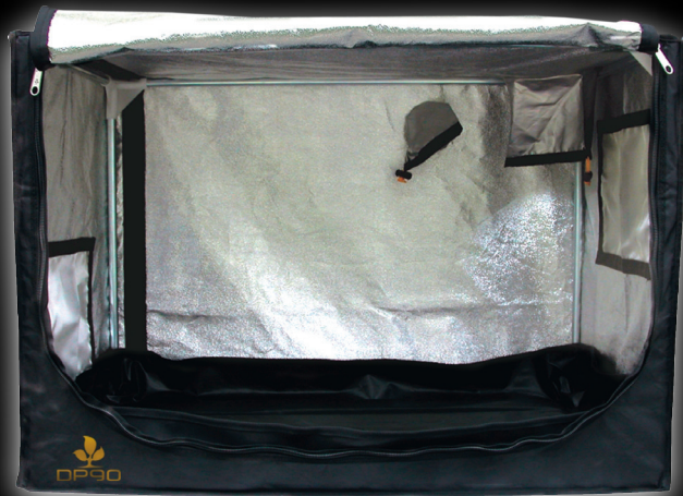
90 cm 60 cm 60 cm DP 90